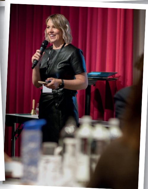
Images taken at NEWH UK Chapter, 2024 Fund Raiser